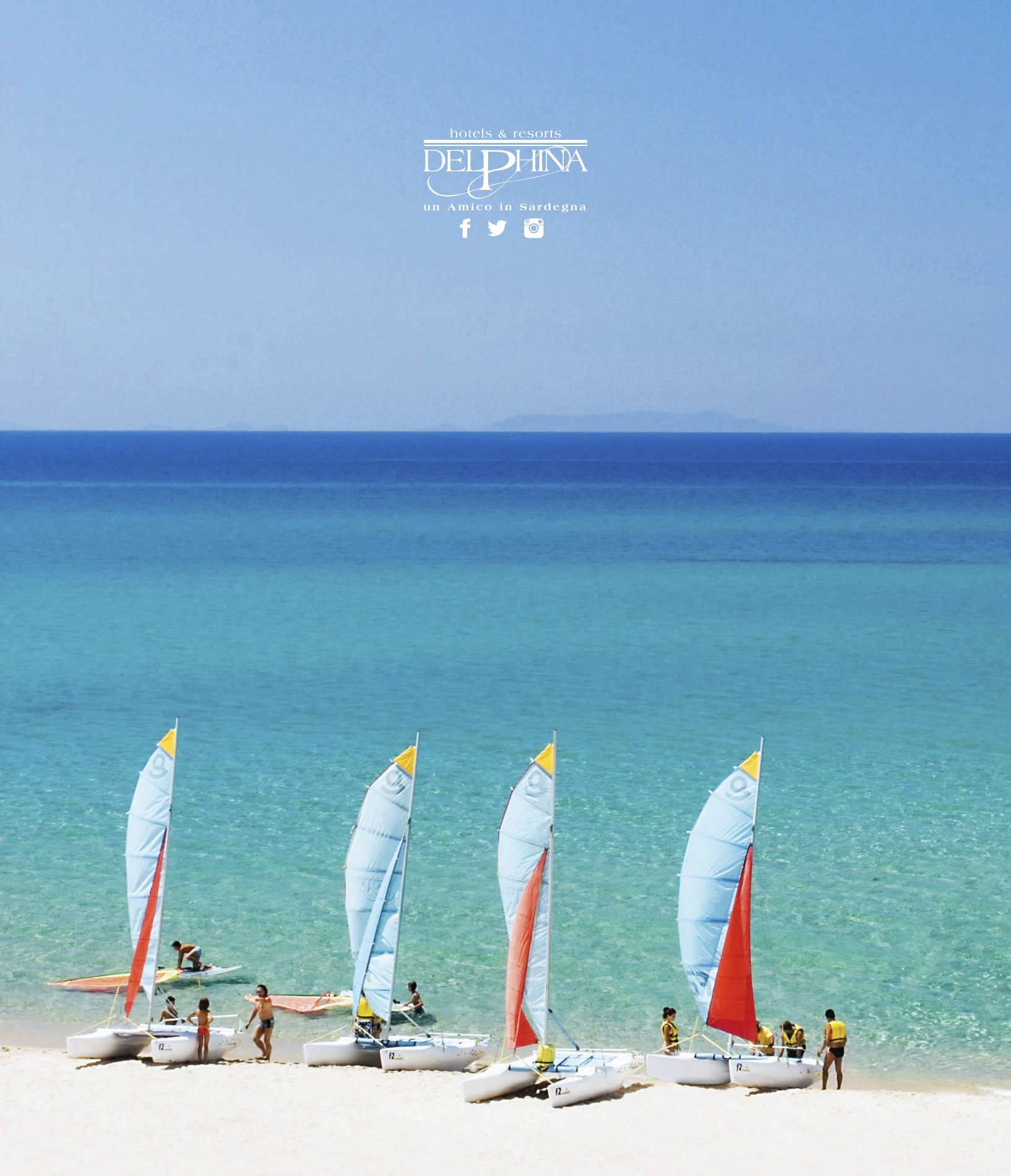
Resort & SPA Le Dune - the beach